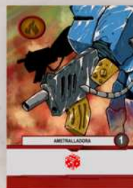
No activated card

Once a player uses a weapon, this gets activated. In order to show that a weapon has been activated, this will be tapped and will remain in a horizontal position.